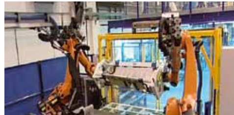
Adaptive Robot Control - driven by Optical CMM or iGPS - establishes a closed feedback loop that nearly eliminates the influence of robot warm-up, drift and backlash.

ARC_EN_0411 - Copyright Nikon Metrology NV 2010. All rights reserved. The materials presented here are summary in nature, subject to change and intended for general information only.